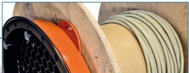
Bracket for screws